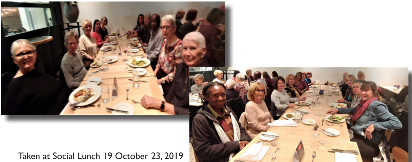
Taken at Social Lunch 19 October 23, 2019